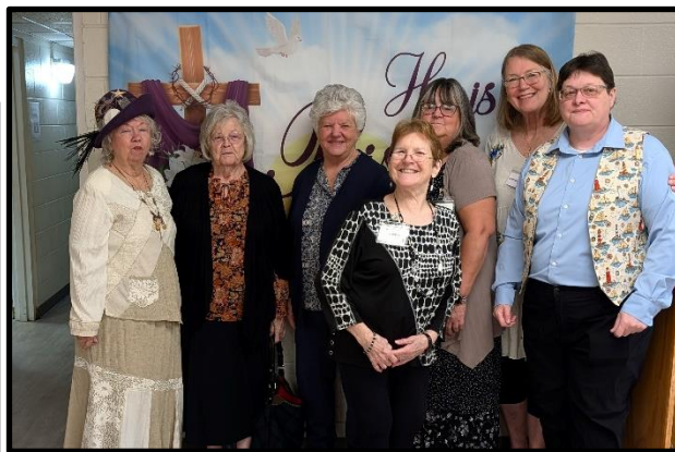
Women's Retreat at McCormick's Creek State Park