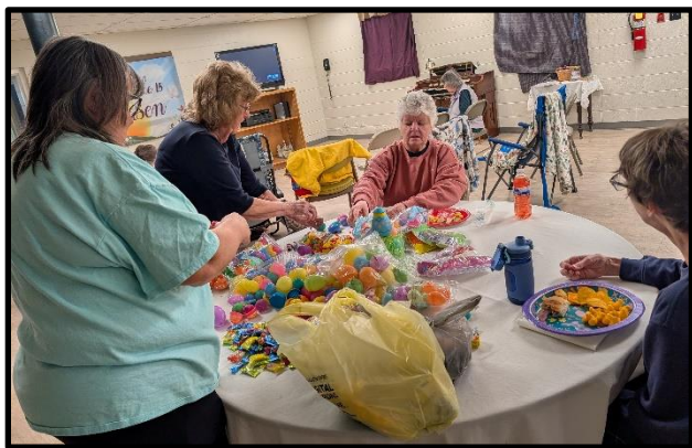
Stuffing Easter Eggs for the kids.