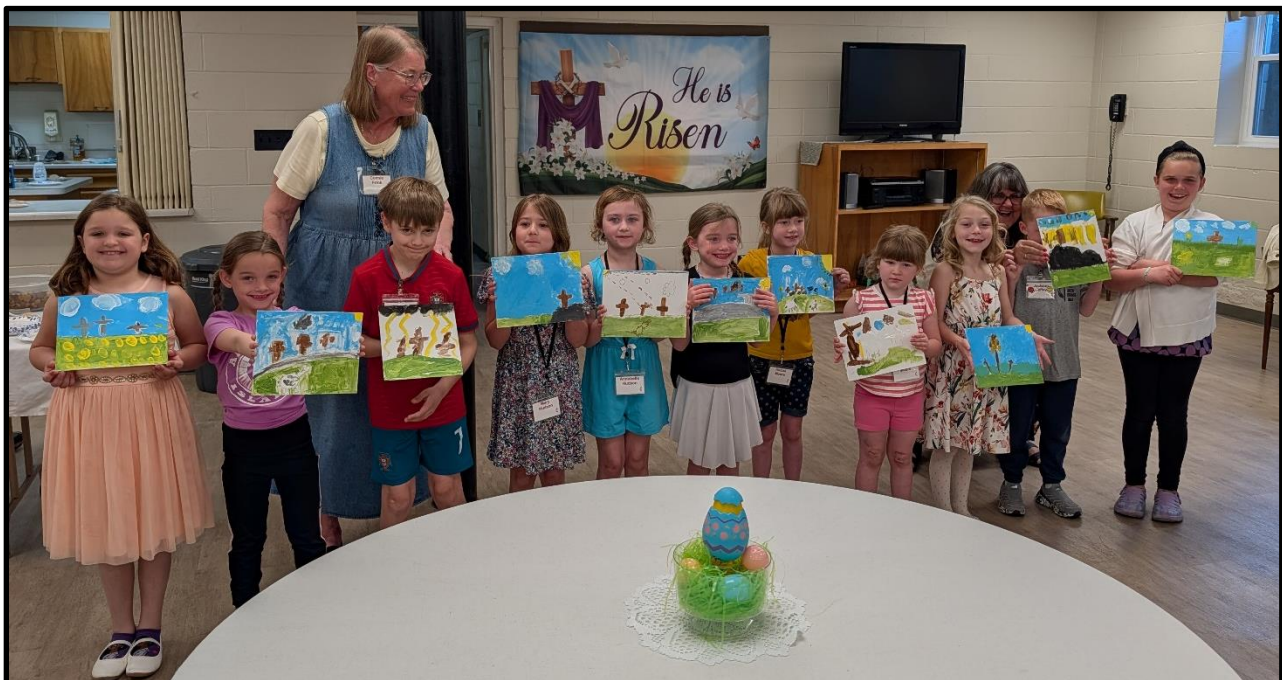
Kids showing off their painting on Family Sunday.